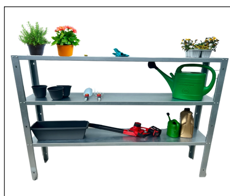
Medium Grow Shelving Unit